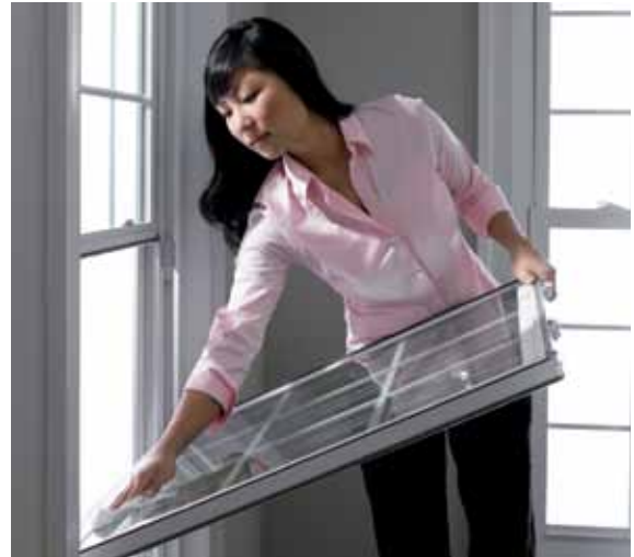
Tilt-in/lift-out sash on Double Hung windows allow both glass surfaces to be cleaned from inside the home.