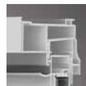
Small dead-air chambers in the vinyl profile increase insulation.