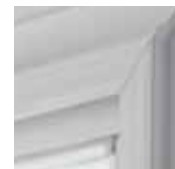
The covered exterior complements any style of home, including wood, stucco, vinyl and brick.