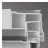
Small dead-air chambers in the vinyl profile increase insulation.