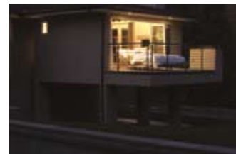
Sleeping Porch Bedroom Cincinnati, OH Aluminum Clad Wood Framed Folding System WA67, Inswing 5L AIA 2005 Small Project Award Winner JonSenhauserArchitects Cincinnati, OH