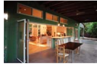
Indoor Outdoor Kitchen Austin, TX Aluminum Framed Folding System SL45, Outswing 3L3R Jackson & McElhane Architects Austin, TX