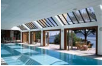
Indoor Swimming Pool Belvedere, Marin County, CA Wood Framed Folding System WD65, Outswing 2L1R