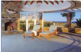
Bay House Newport, RI Thermally Broken Aluminum Framed Individual Panel Sliding System HSW50 William L. Burgin Architects Newport, RI