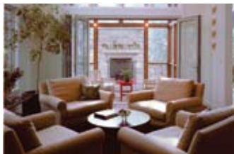
Austin Residence Austin, TX Aluminum Clad Wood Framed Folding System WA67 Inswing 3L1R AIA Austin Home Tours 2005 McKinney Architects Austin, TX