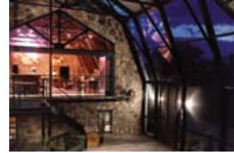
Stone Barn Ranch Blanco, TX Wood Framed Folding System, Inswing 3L3R AIA Austin Merit Award Texas Society of Architects Honor Award Jackson & McElhane Architects Austin, TX