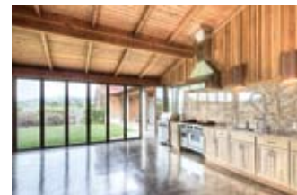
Back Cover Outdoor Kitchen Fairfield, CA Aluminum Framed Folding System SL50, Inswing 6L1R