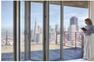
Russian Hill Penthouse San Francisco, CA Aluminum Framed Folding System SL70, Outswing 5L Tekton Architecture, Inc. San Francisco, CA